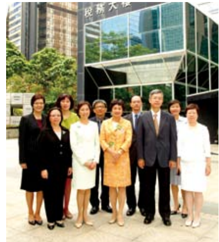
Figure 39 Staff establishment

As at 31 March 2008, the Department had an establishment of 2,818 permanent posts (including 25 posts for directorate officers) in the Commissioner's Office and 6 Units. Of the total, 1,793 posts were in departmental grades (namely Assessor, Taxation Officer and Tax Inspector grades), the duties of which are directly concerned with taxation. The remaining 1,025 posts were in common/general grades and provide administrative, information technology and clerical and other support services ( Figure 39 ).