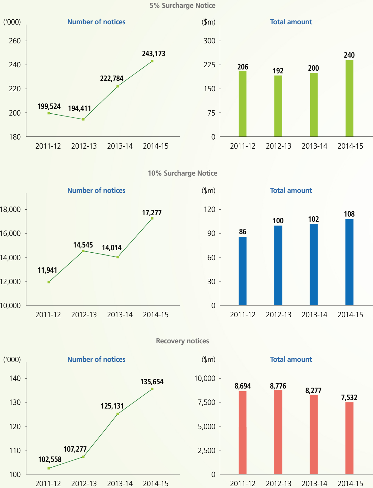
Figure 27 Recovery action