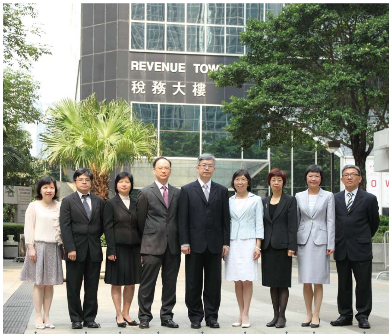
Mr CHU Yam-yuen Commissioner of Inland Revenue